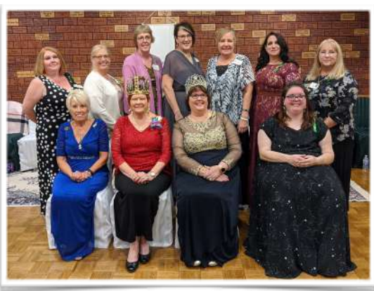
Welcome to our 8 New Princesses!